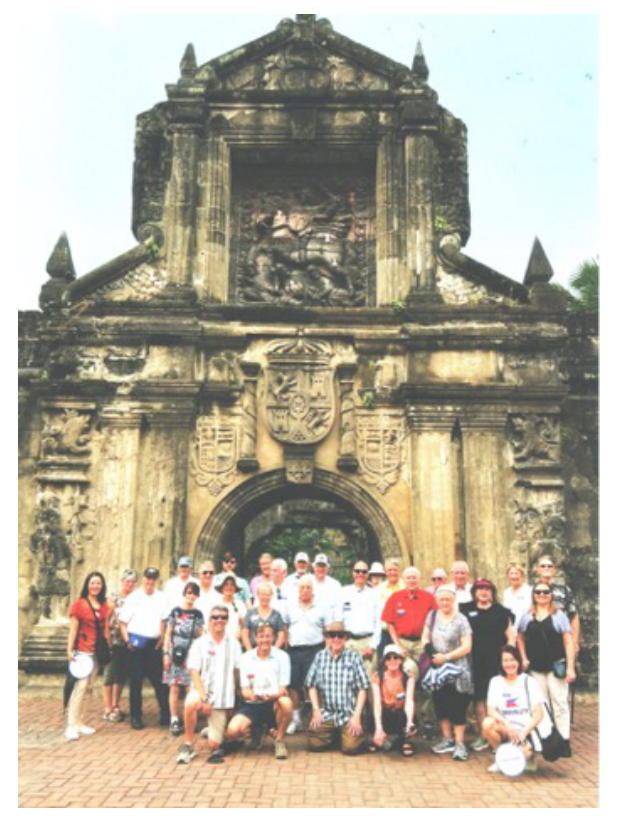
National WWII Museum tour at Gate to Fort Santiago, 2023