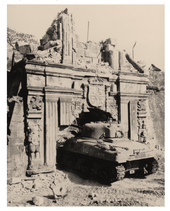
Gate to Fort Santiago Battle of Manila, 1945