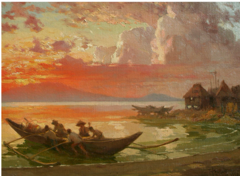
Painting, "Manila Bay", by Fernando Amorsolo.